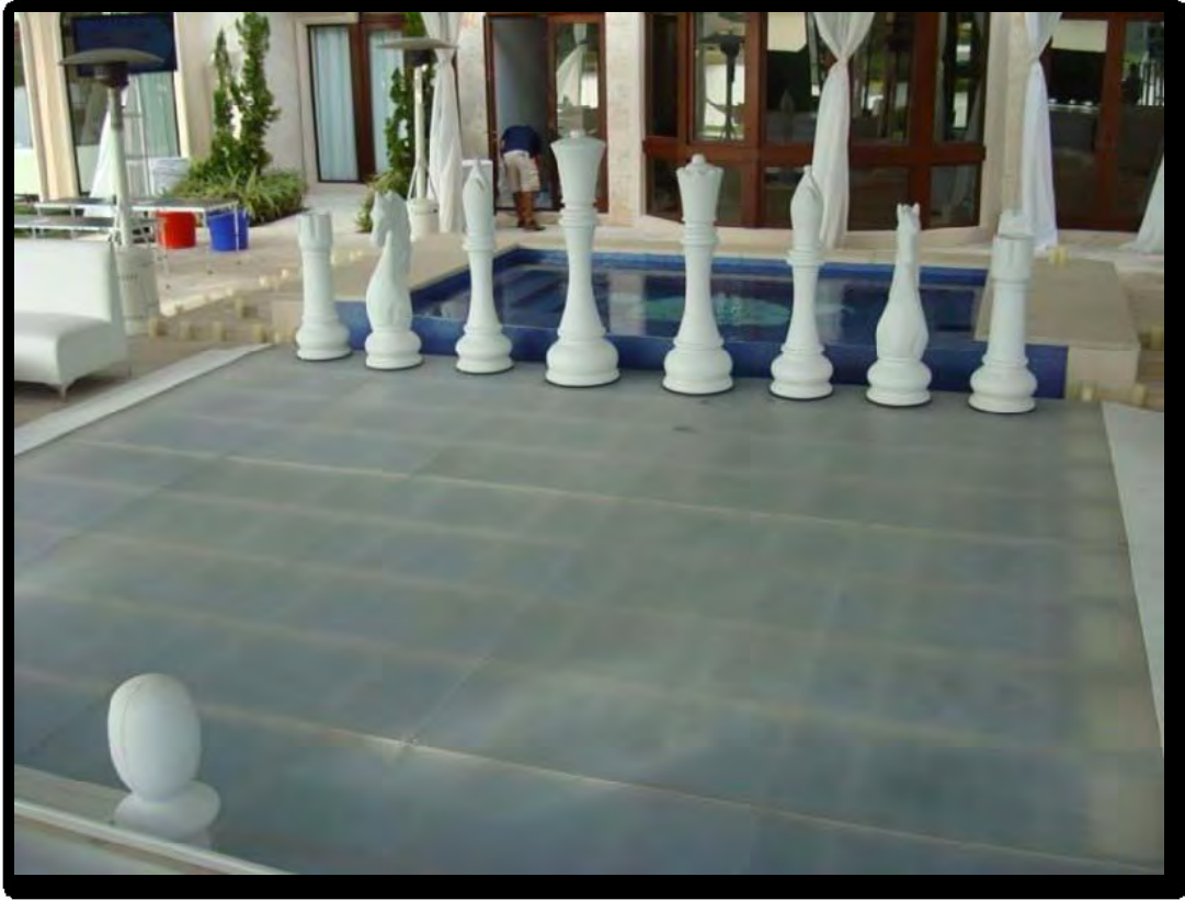
Frosted Acrylic Pool Covers