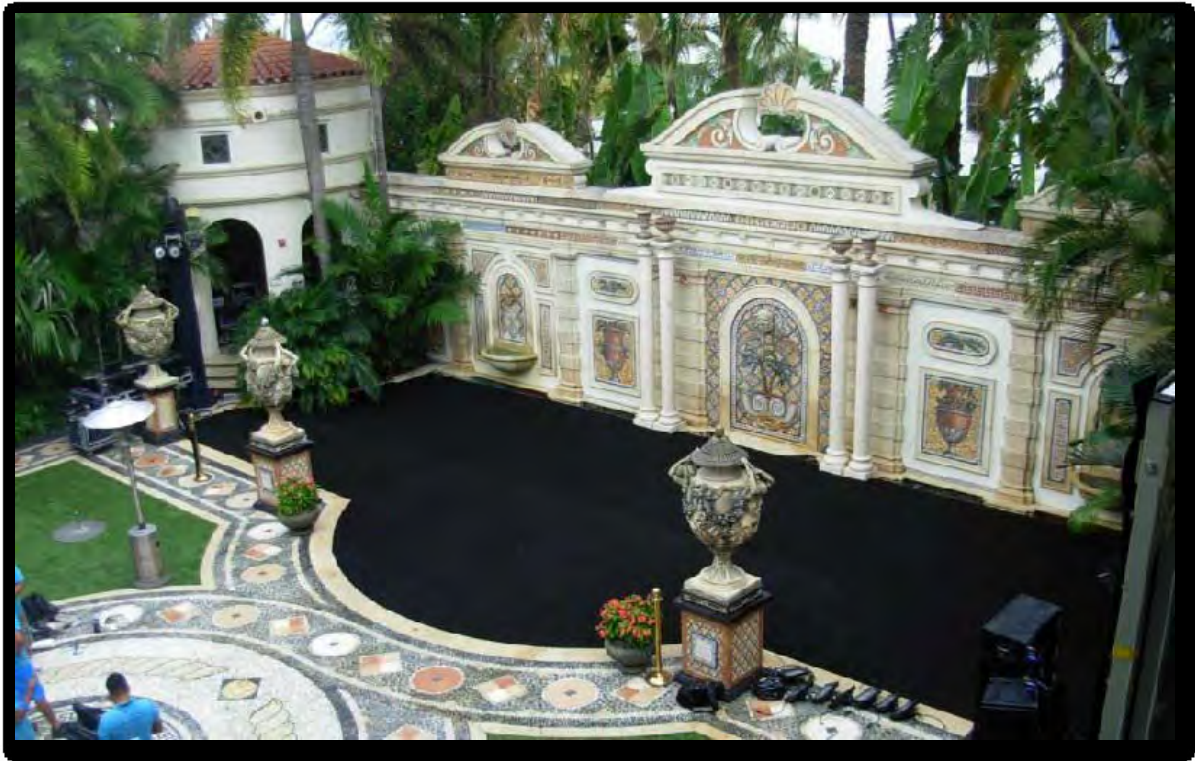
Carpeted Pool Covers