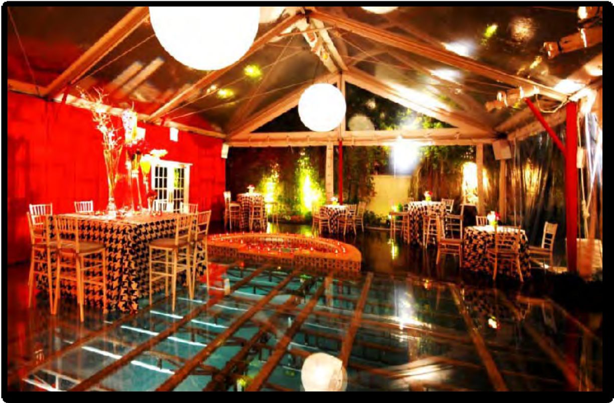
Clear Acrylic Pool Covers